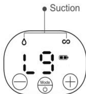
Suction level 9