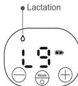
Lactation level 9

Easy assembly way within 8 steps for users