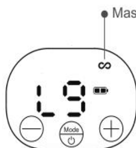
Massage level 9