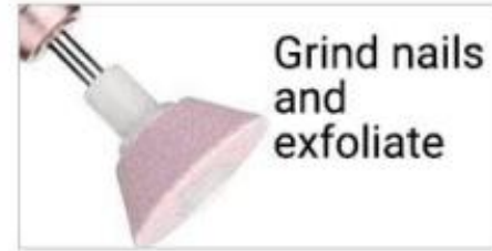
Coarse Disc Bit